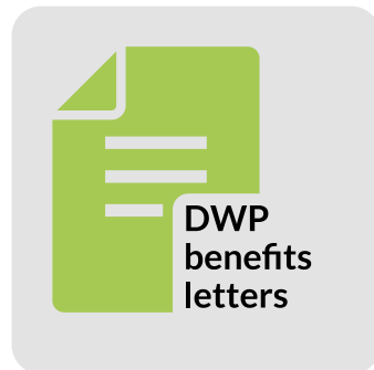
DWP benefit letters