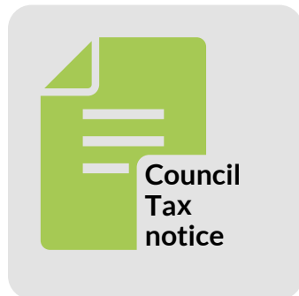
Council Tax notice