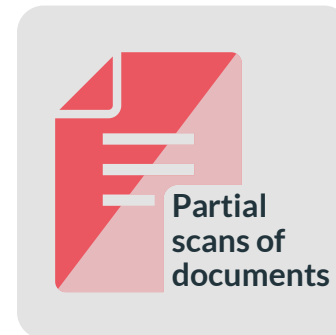
Partial scans of documents

This can include only providing the first page of a multi-page document (We need clear full copies of all pages).